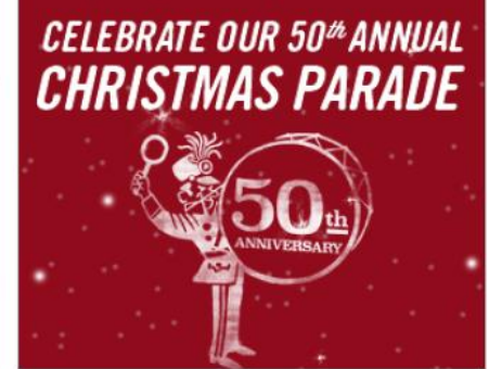
New copy fades in as drummer slides in from left to right, moving off the screen.