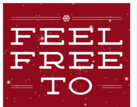
Copy fades in as snow falls in the background (throughout the animation).