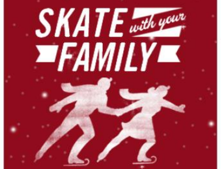
New copy fades in as skaters slide in from left to right, moving off the screen.