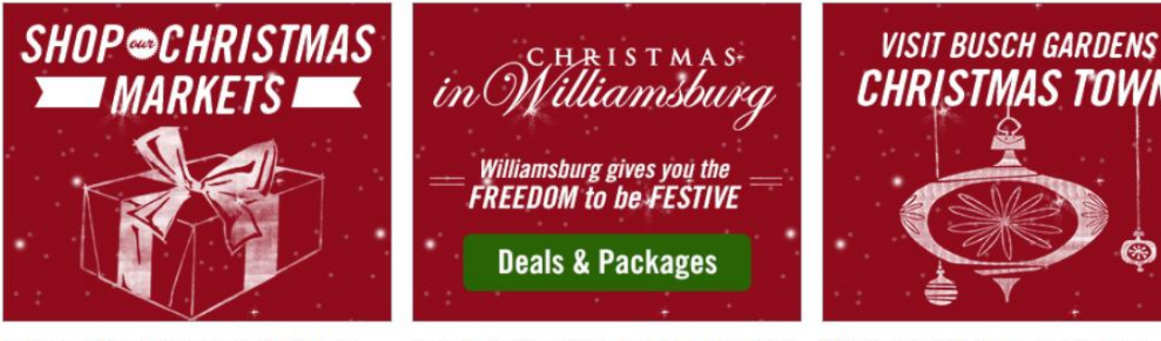
New copy fades in as present slides in from left to right, moving off the screen.