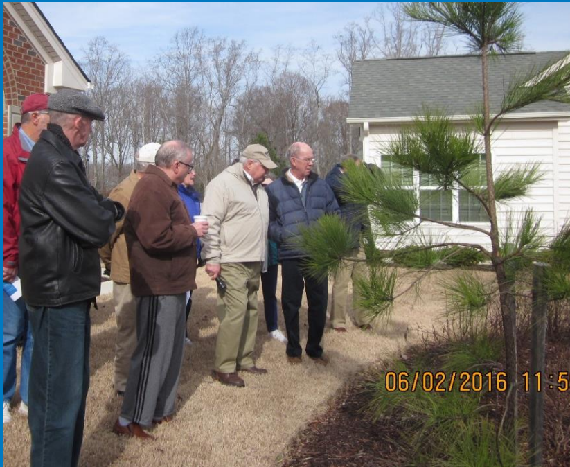
BMP Maintenance Workshop 2016 Colonial Heritage Clubhouse