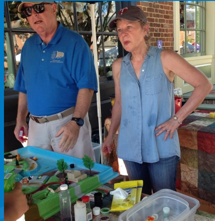
EnviroScape Demonstration at Williamsburg Farmers Market, 2017