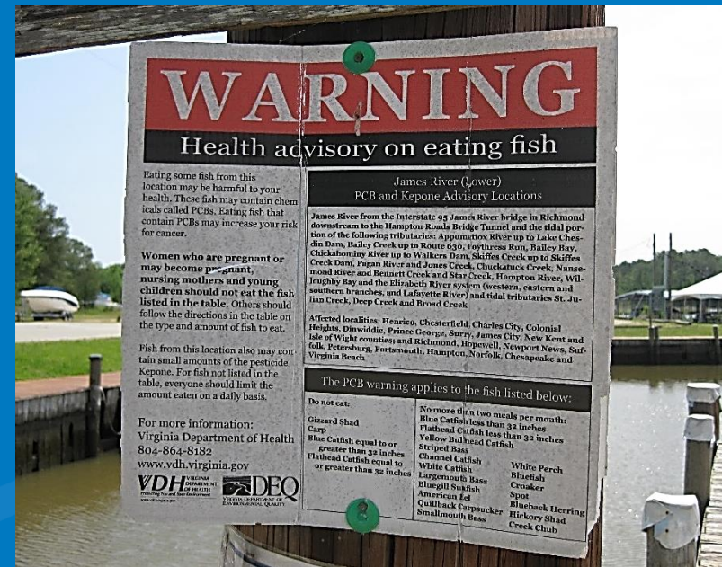
Fish Consumption Advisory Jamestown Marina