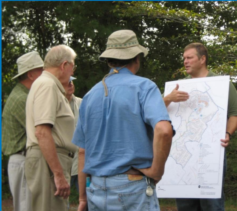
Mill Creek Watershed Tour 2011