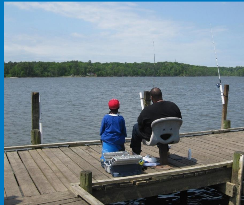
Fishing at Chickahominy Riverfront Park